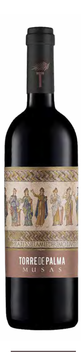
TORRE DE PALMA MUSAS RED WINE 2019