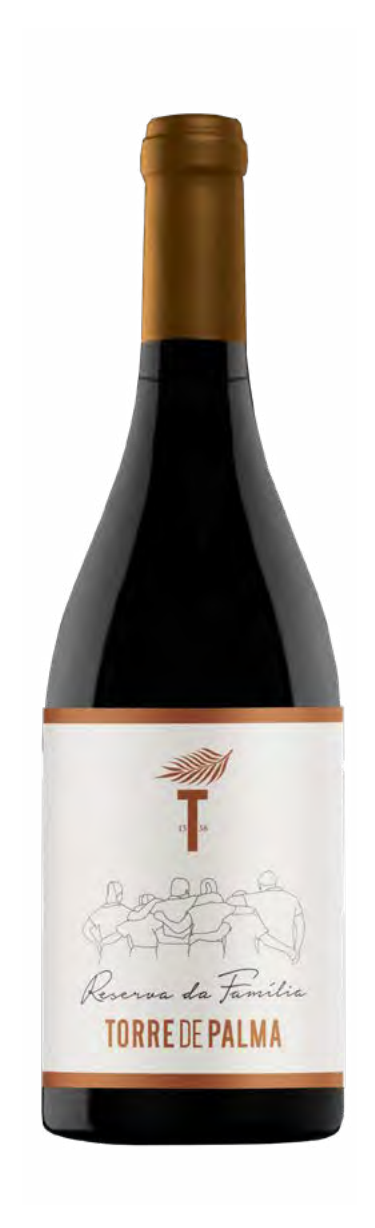
TORRE DE PALMA RESERVA DA FAMÍLIA WHITE WINE 2017